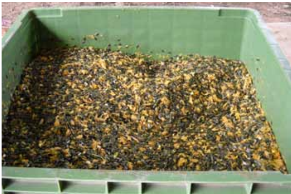
Figure 13: Once the pumpkin seed was transferred to a bin it was allowed to 'sit' (under cover) for approximately 24 hours prior to washing