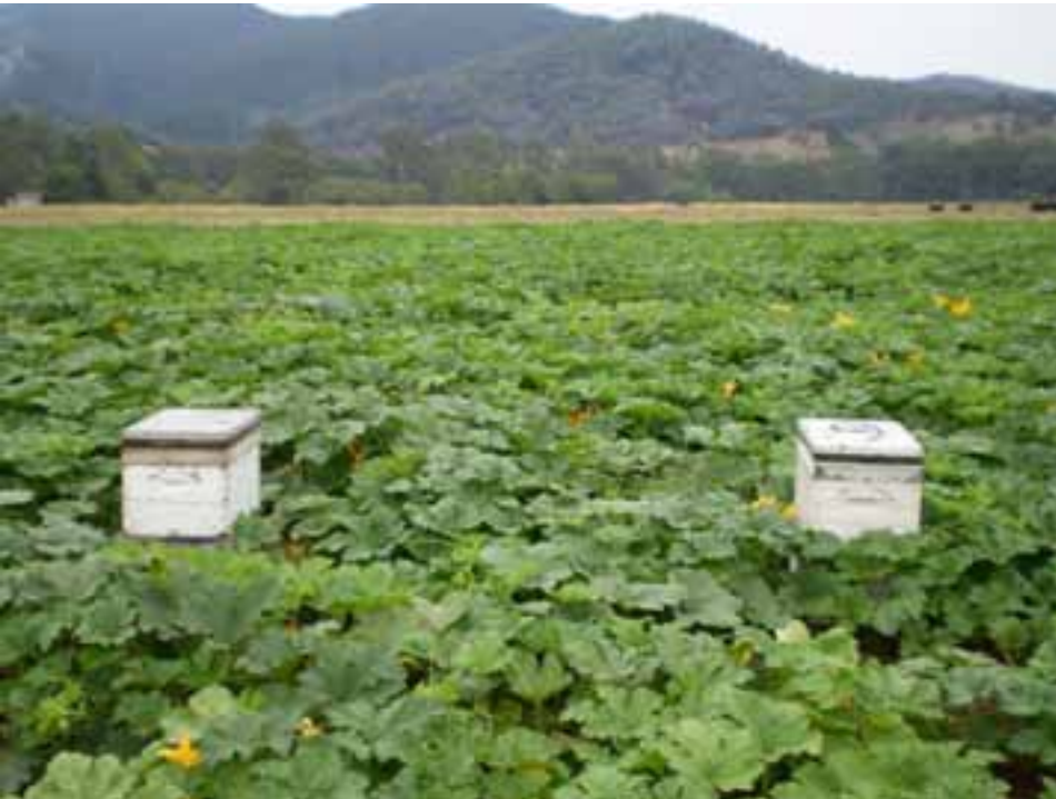
Figure 5: Flowering commenced approximately six weeks post planting