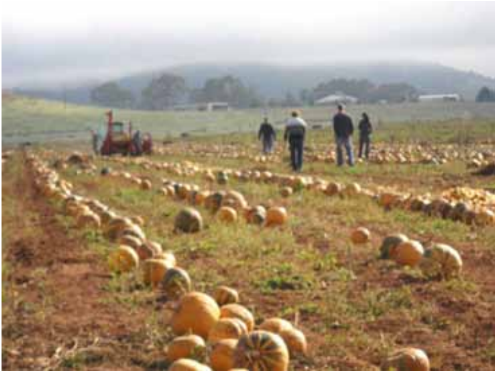
Figure 9: Mechanical harvest commenced approximately nineteen weeks post planting