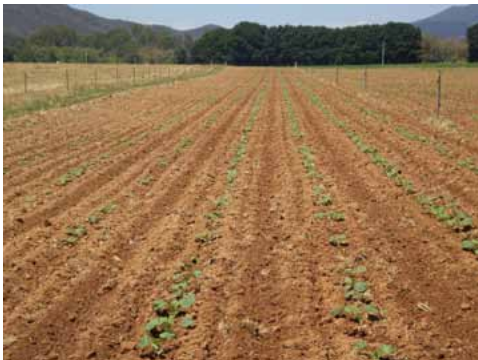
Figure 3: Seedlings two weeks post planting