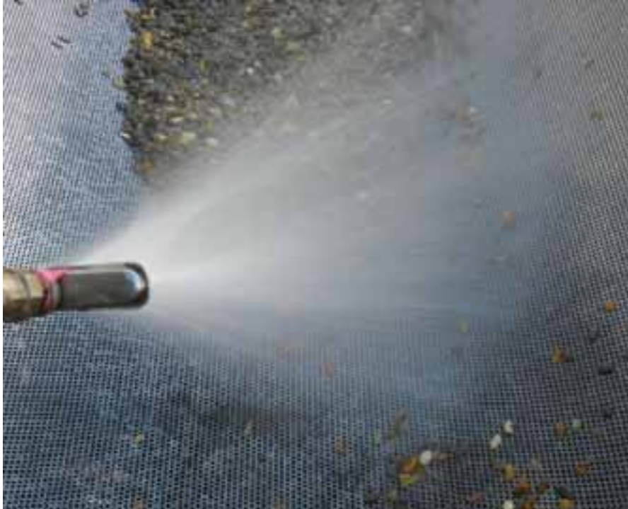
Figure 14: Hand washing of the pumpkin seed removed remnants of pumpkin flesh (this operation can be mechanised)