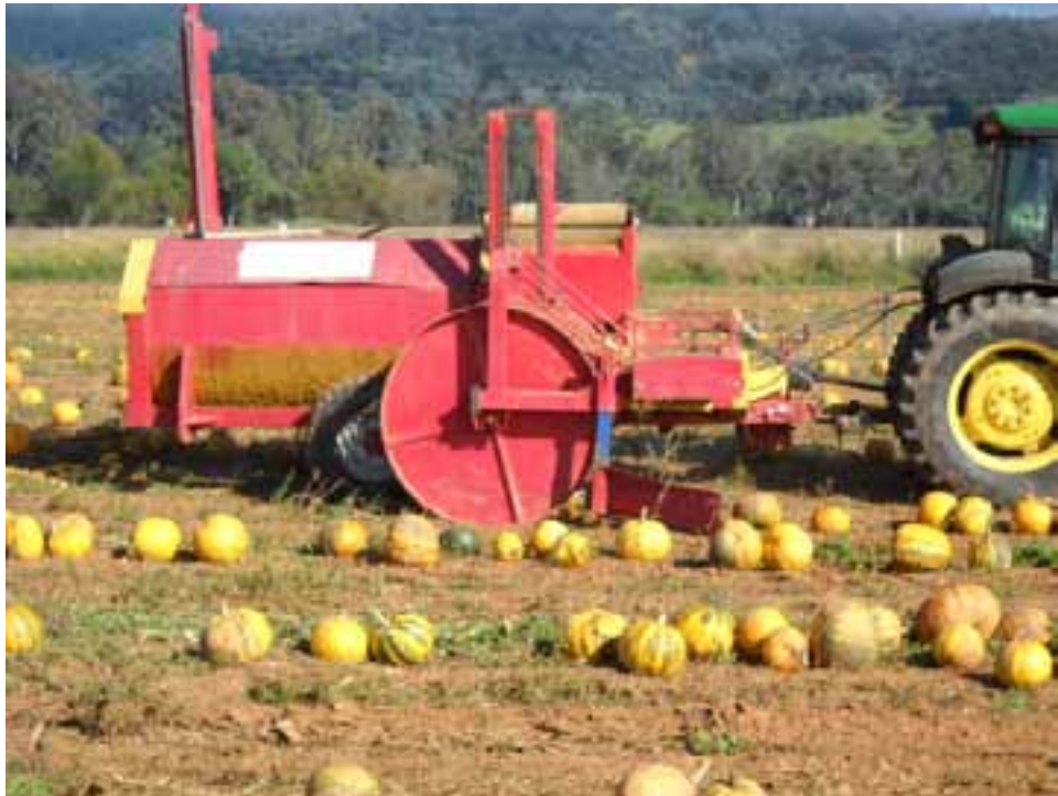
Figure 10: Side view of mechanical harvester in operation