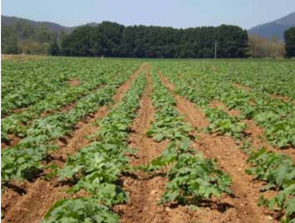
Figure 4: Pumpkin development four weeks post planting