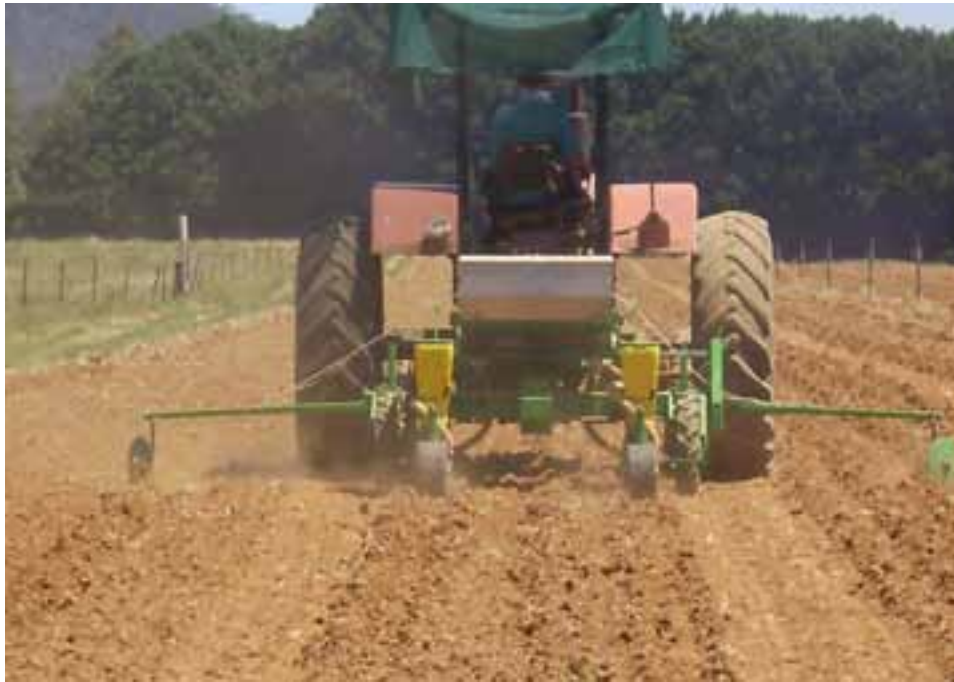
Figure 2: First seeding of Cucurbita pepo subsp. pepo var. styriaca l. Greb at Myrtleford (18 November 2010)