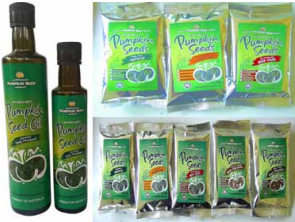
Figure 17: Value adding of pumpkin seed can include oil and snack seed products