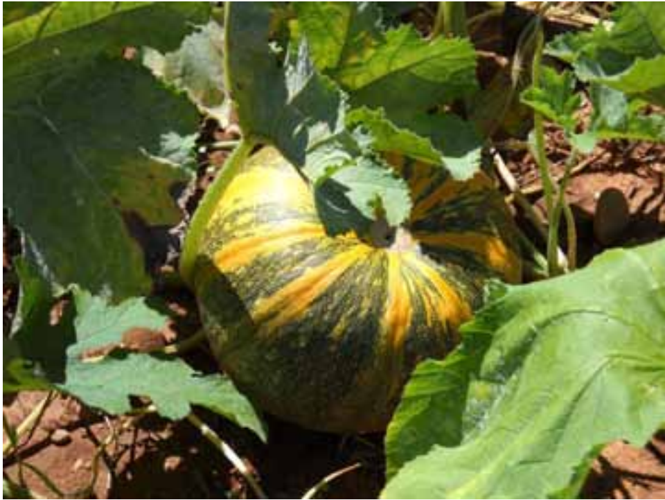
Figure 7: Early signs of fruit maturation occurred approximately twelve weeks post planting