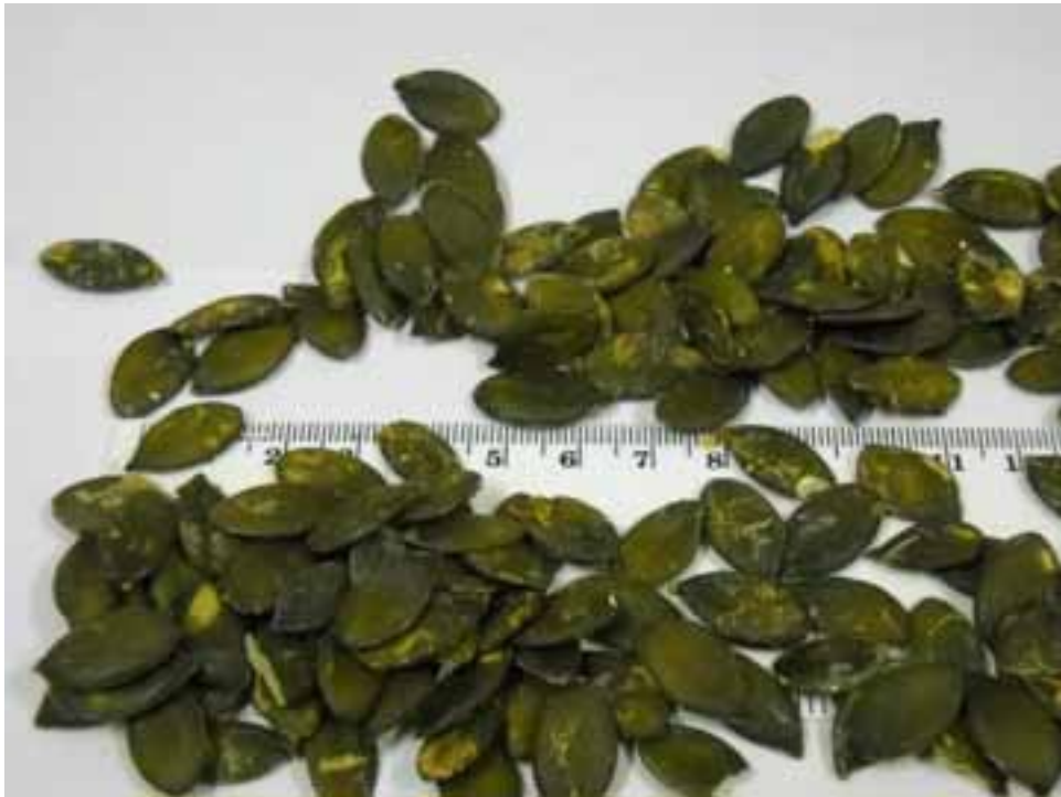
Figure 16: Following the drying procedure the pumpkin seed was prepared for short term storage prior to colour sorting and 'value adding'