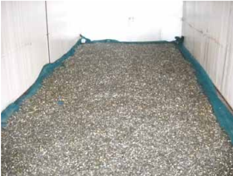
Figure 15: The washed pumpkin seed was transferred to a drying facility for up to 48 hours (this operation can be further mechanised)