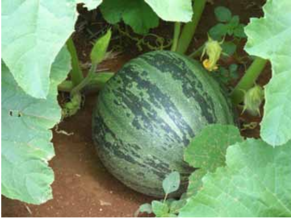
Figure 6: Early fruit development commenced approximately eight weeks post planting