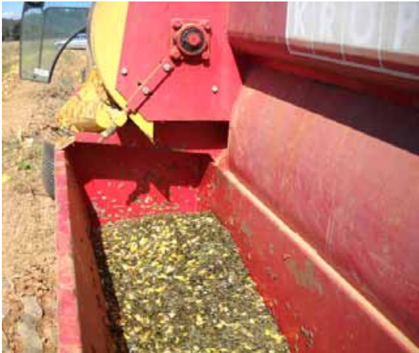
Figure 12: The harvested pumpkin seed with remnants of the pumpkin flesh ready to be augered into bins