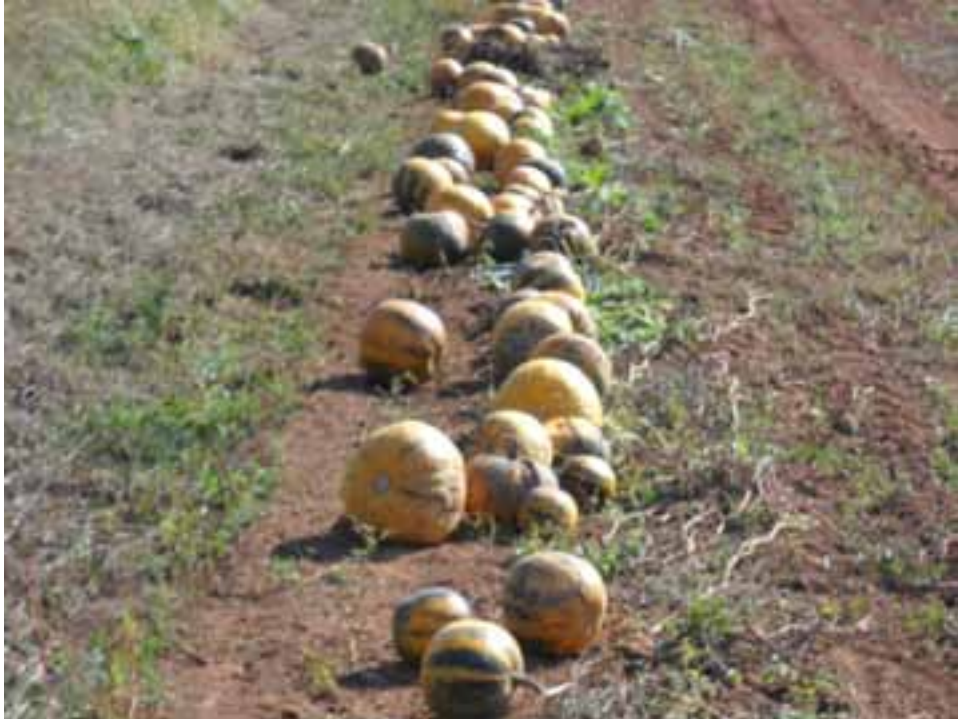
Figure 8: Once seed maturity was confirmed the pumpkins were machine windrowed and allowed to 'sit' for a few days prior to mechanical harvest (approximately eighteen weeks post planting)