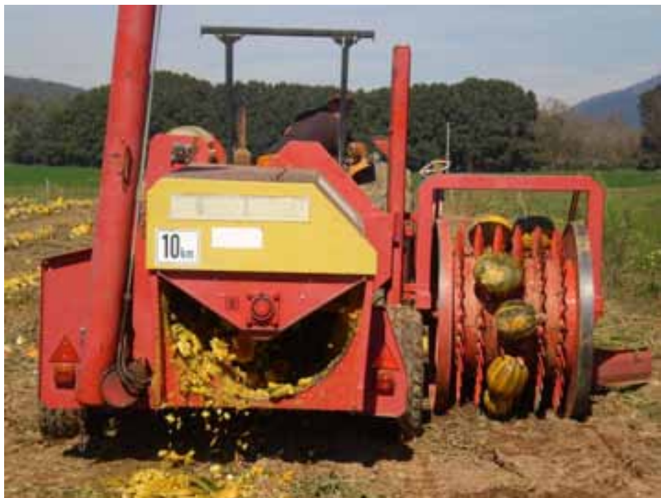
Figure 11: Rear view of mechanical harvester in operation